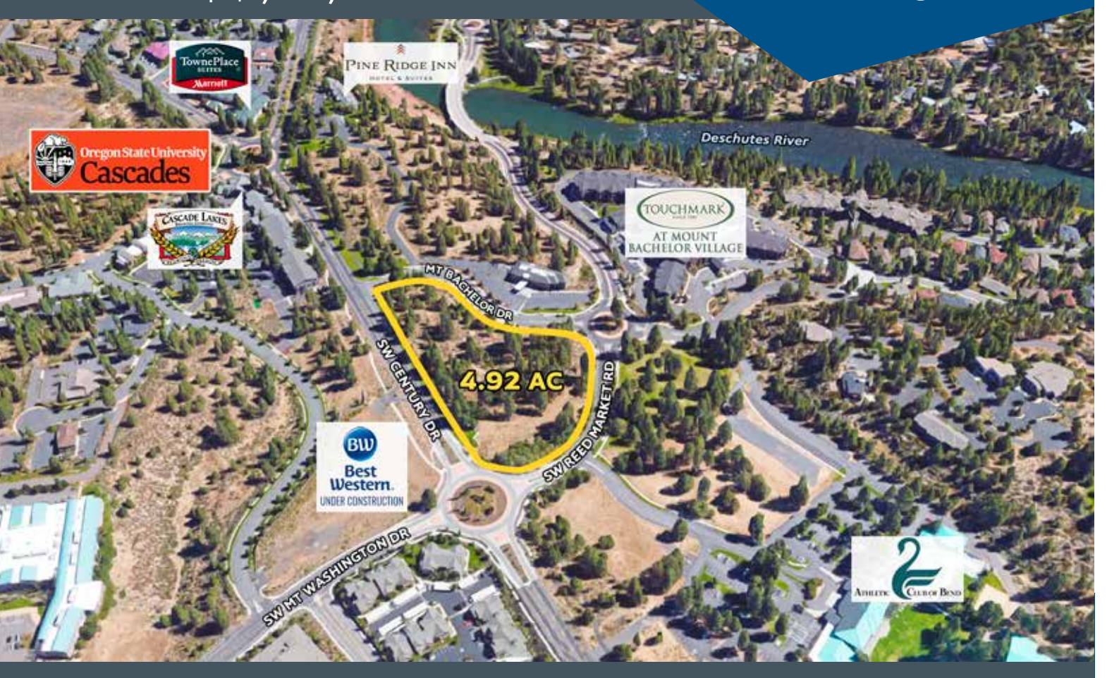
Near the Deschutes River and the OSU-Cascades Campus