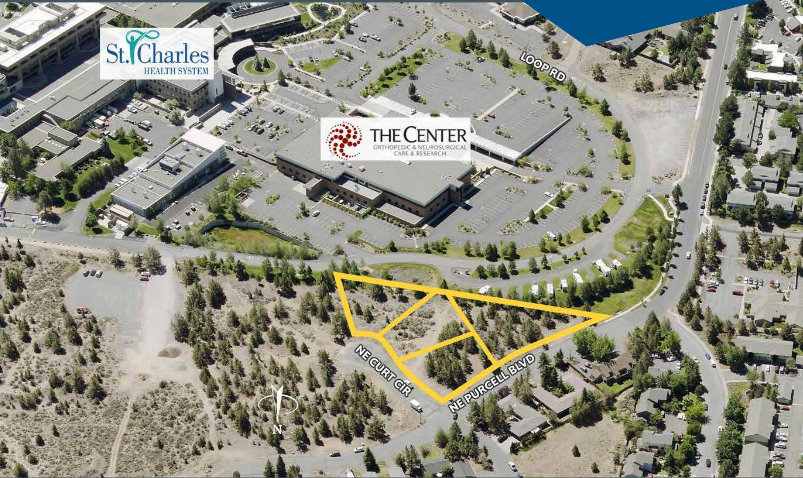
Four Lots Adjacent to St. Charles Campus